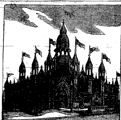
Shour City Corn Palace—Opens Sept. 25; closes Oct. 11, 1890.

Dr. King's New Discovery for Consumption, coughs and colds. I feel as if I should like to see you.